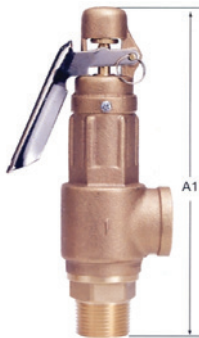
N3L Type Lever 1/2"~2"